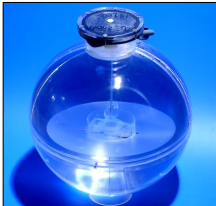
The Datawell stabilized platform sensor